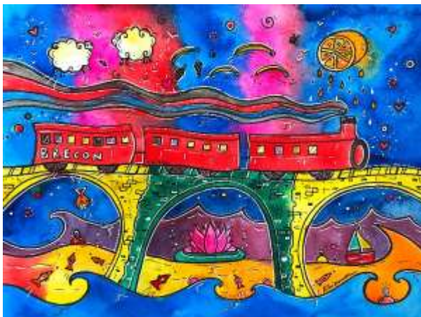
Fiazan from Y3 (now Y4) was selected as the third-place winner.