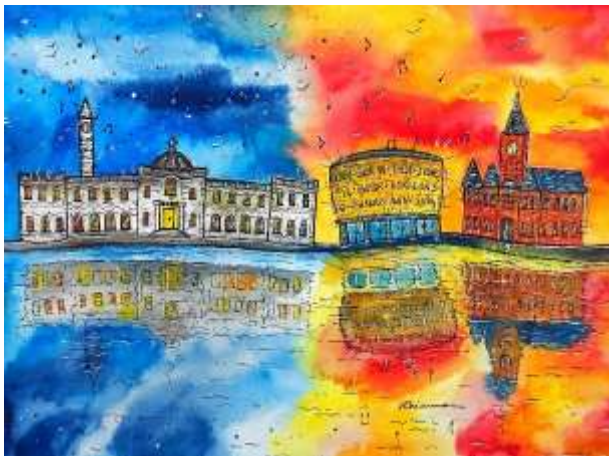
Noah from Y4 (now Y5) was selected as the second-place winner.